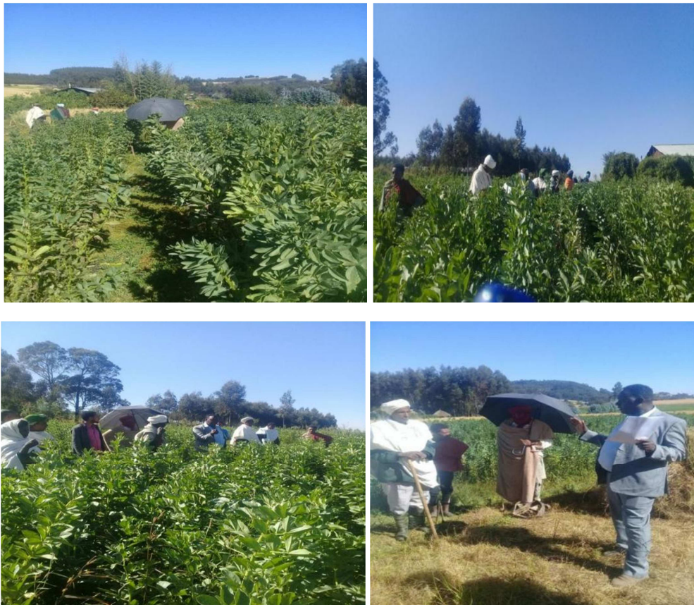
Figure 2. Farmers during variety selection.

Participatory variety selection was significantly important to evaluate and select new varieties and is an advantage to exploit farmers' indigenous knowledge of identifying adapted varieties that best meet their interests. Therefore, based on considerably measured parameters, farmers' preferences the Fababean varieties Gora, Numan, and Ashebeka were selected for the study area. Among the seven tested Fababean varieties, those varieties were found sound adapted at Gunabegemidir district in the farmer's selection criteria. Therefore, farmers are recommended to use those varieties for production and expand in the next season for similar agroecology of the South Gonder zone.